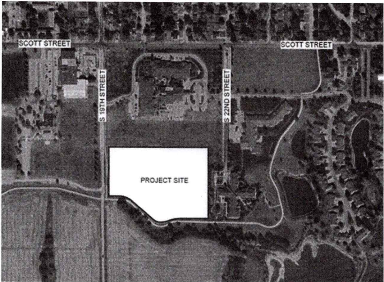
EXHIBIT "B" Site Plan